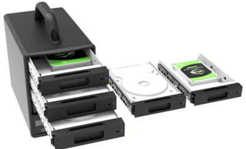
Key Features of ST4F-B32:

Engineered for speed, reliability, and versatility, the ST4F-B32 empowers you to take control of your data with confidence. Integrate with the <u>Easy Data Vault iOS app</u> for secure backups – no cloud subscriptions, no hassle.